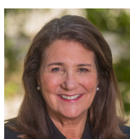
Congresswoman Diana DeGette (D-CO)