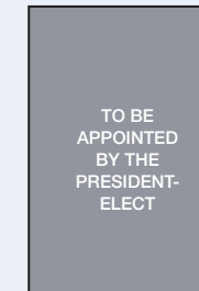
Chair of the Committee on Diversity and Inclusion (CODI) Ex-Officio (non-voting)