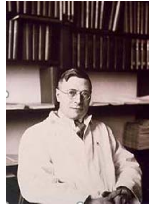
James Collip, MD President | 1926 Association For The Study of Internal Secretions (predecessor of Endocrine Society)