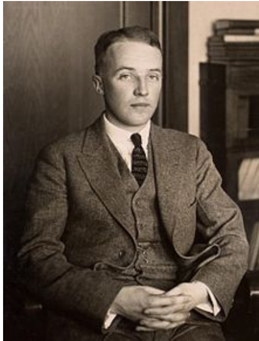
Charles Best, MD First Vice President | 1924 Association For The Study of Internal Secretions (predecessor of Endocrine Society)